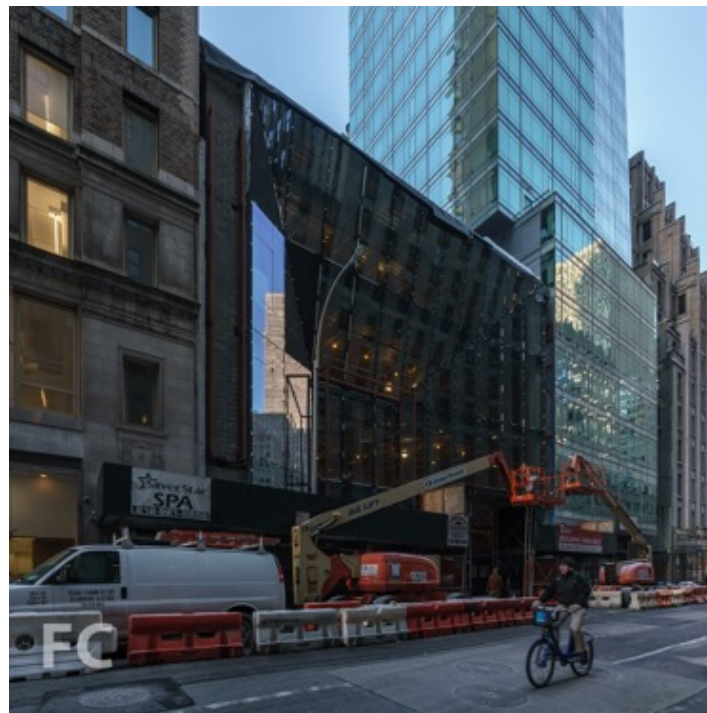
North facade from West 48th Street.

Exterior facade installation is wrapping up at DNA Development's 12 West 48th Street, a new stand-alone white box property with flexibility to accommodate office and retail. Designed by Ennead Architects, the project is adjacent to Rockefeller Center and includes 30,939 square feet of space across four floors, with a basement and fifth floor rooftop terrace for tenants. Ceiling heights range from 15'-8" at the upper floors to 20' at the ground floor. An angled glass façade clads the 48th Street frontage and opens up the views along the street.