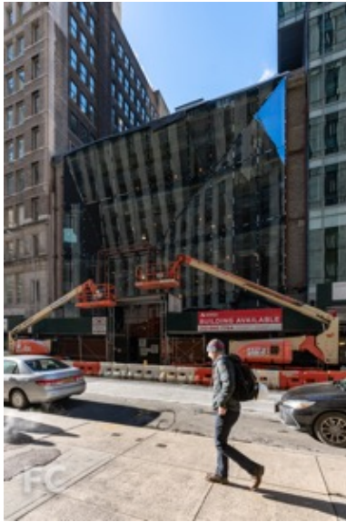
North facade from West 48th Street.