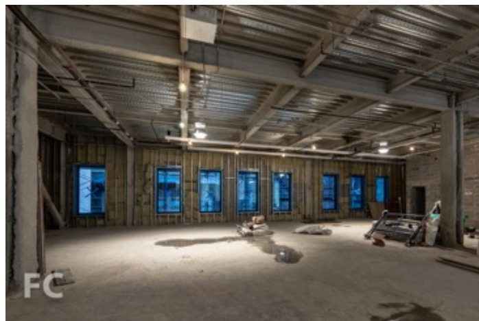
Third floor facing south towards rear terrace.