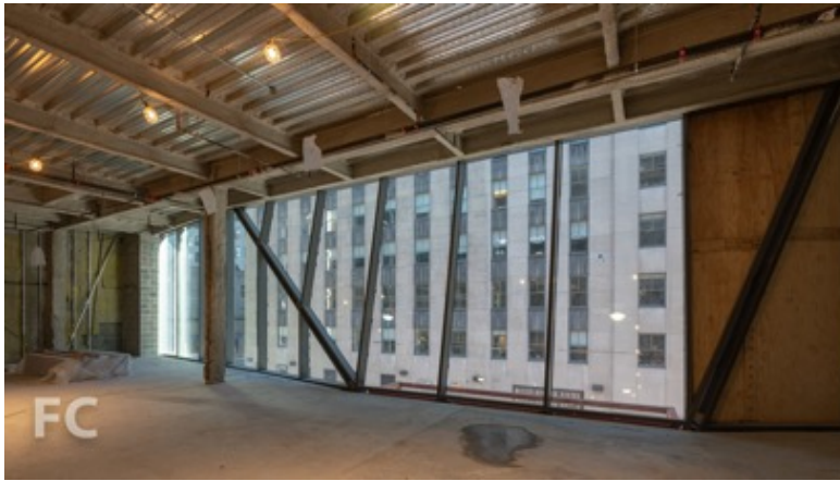
North facing views from the third floor.