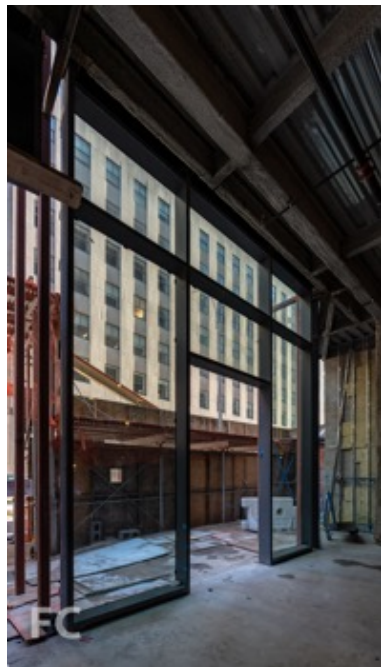
Future ground floor entry.