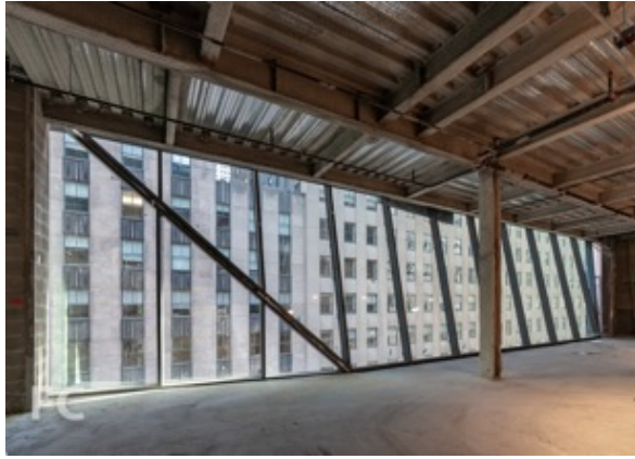
North facing views from the fourth floor.