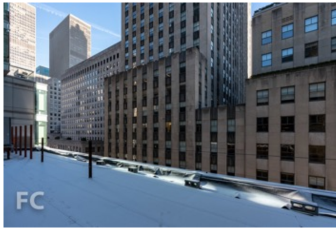
Future rooftop terrace at the fifth floor.