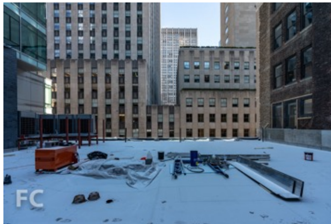
Future rooftop terrace at the fifth floor.

Architect: Ennead Architects; Developer: DNA Development; Program: Office, Retail; Location: Midtown, New York, NY; Completion: 2019.